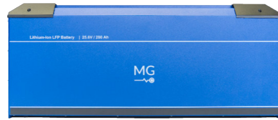
LFP battery modules 25.6 V - 7.2 kWh

This robust battery is based on the next generation LiFePo4 chemistry. The advantage of this next generation chemistry is the higher energy density. The modules are very compact and light weight with high charge and discharge capability. The LFP series can be used for a wide range of applications. For example small systems with using only one module or large systems with 16 modules in series.